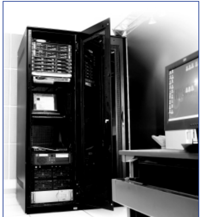
The PrintCabinet can be easily installed on a desktop or rack-mounted in a network cabinet.

Supported browsers: Microsoft Internet Explorer 5.0 or later