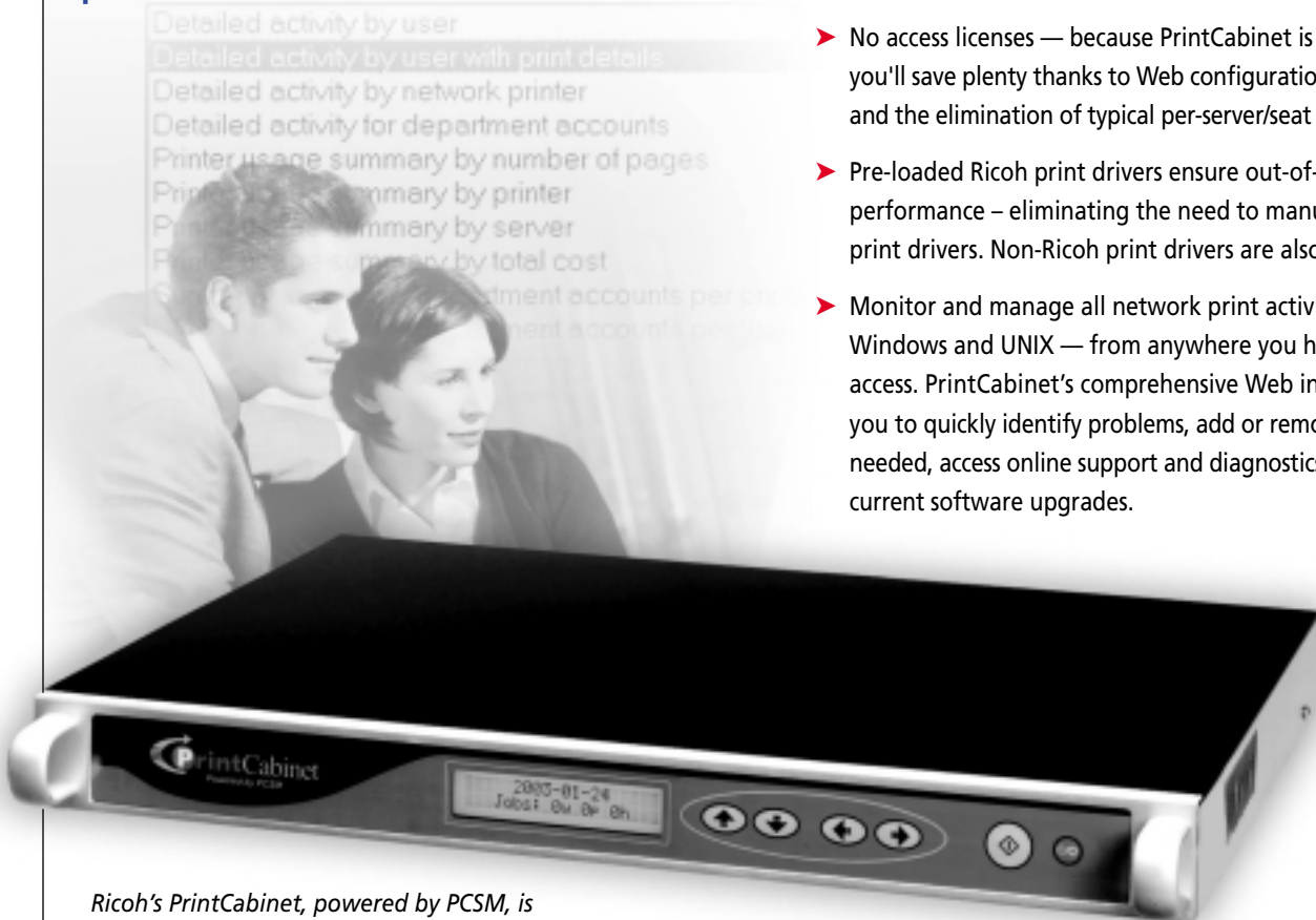
Ricoh's PrintCabinet, powered by PCSM, is the turnkey appliance that manages network printing, copy costs and security.